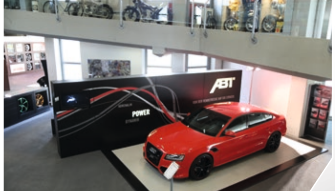
For more details visit www.abt-america.com